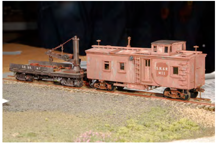
Work cars contest entry at the November 2011 meet